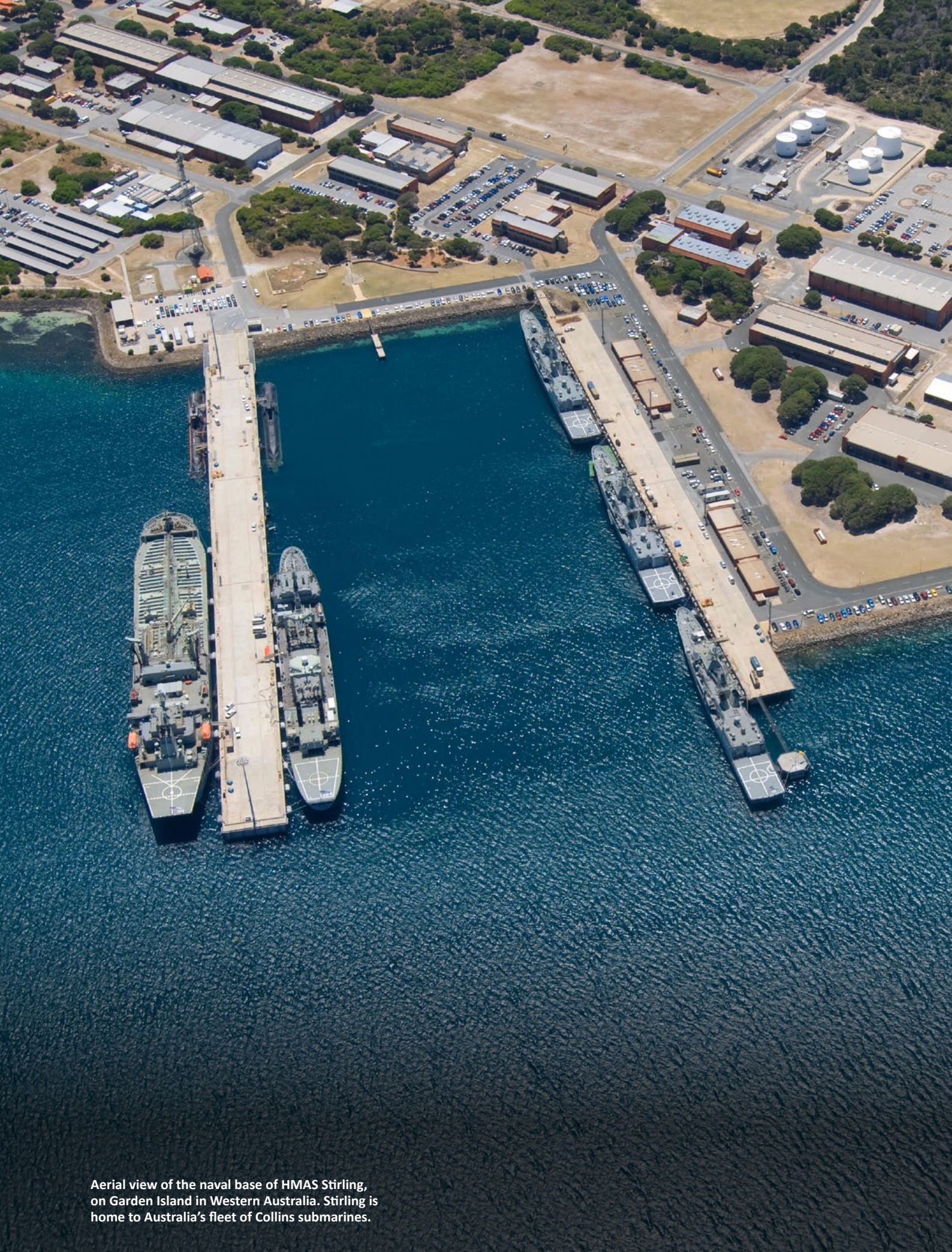
Aerial view of the naval base of HMAS Stirling, on Garden Island in Western Australia. Stirling is home to Australia's fleet of Collins submarines.